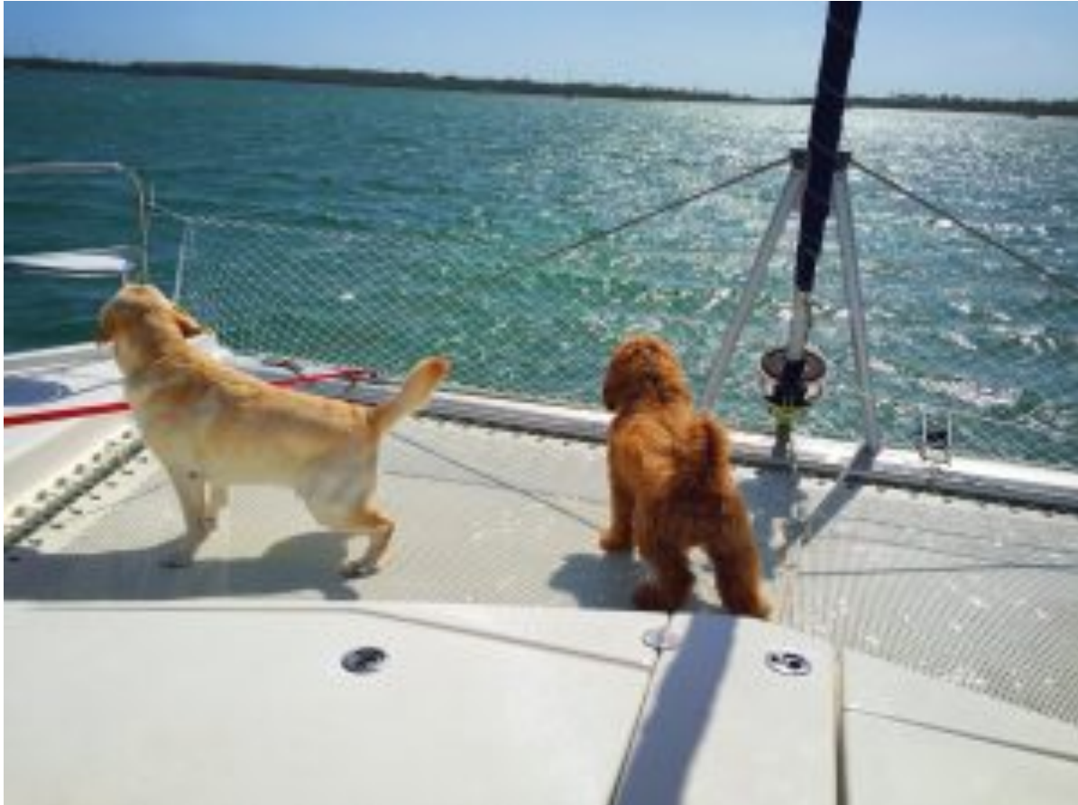
Morning meeting on the trampoline.

As always, we want you to know that some of the links above are affiliate links to products or services that we truly believe in and shared, because they are helpful & useful. So, at no additional cost to you , we'll earn a small commission if you decide to make a purchase after clicking through these links.