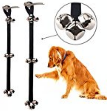
Optional bells for dogs to ring