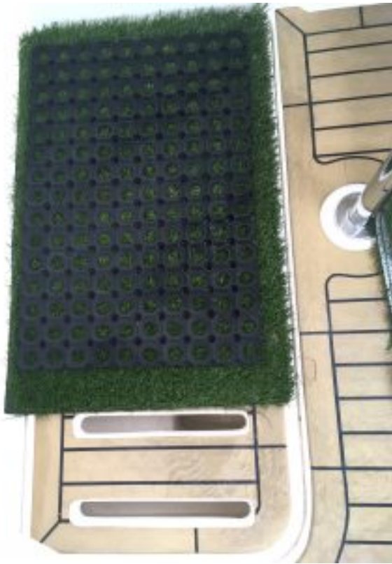
Above: Forward cockpit with mats over scupper.